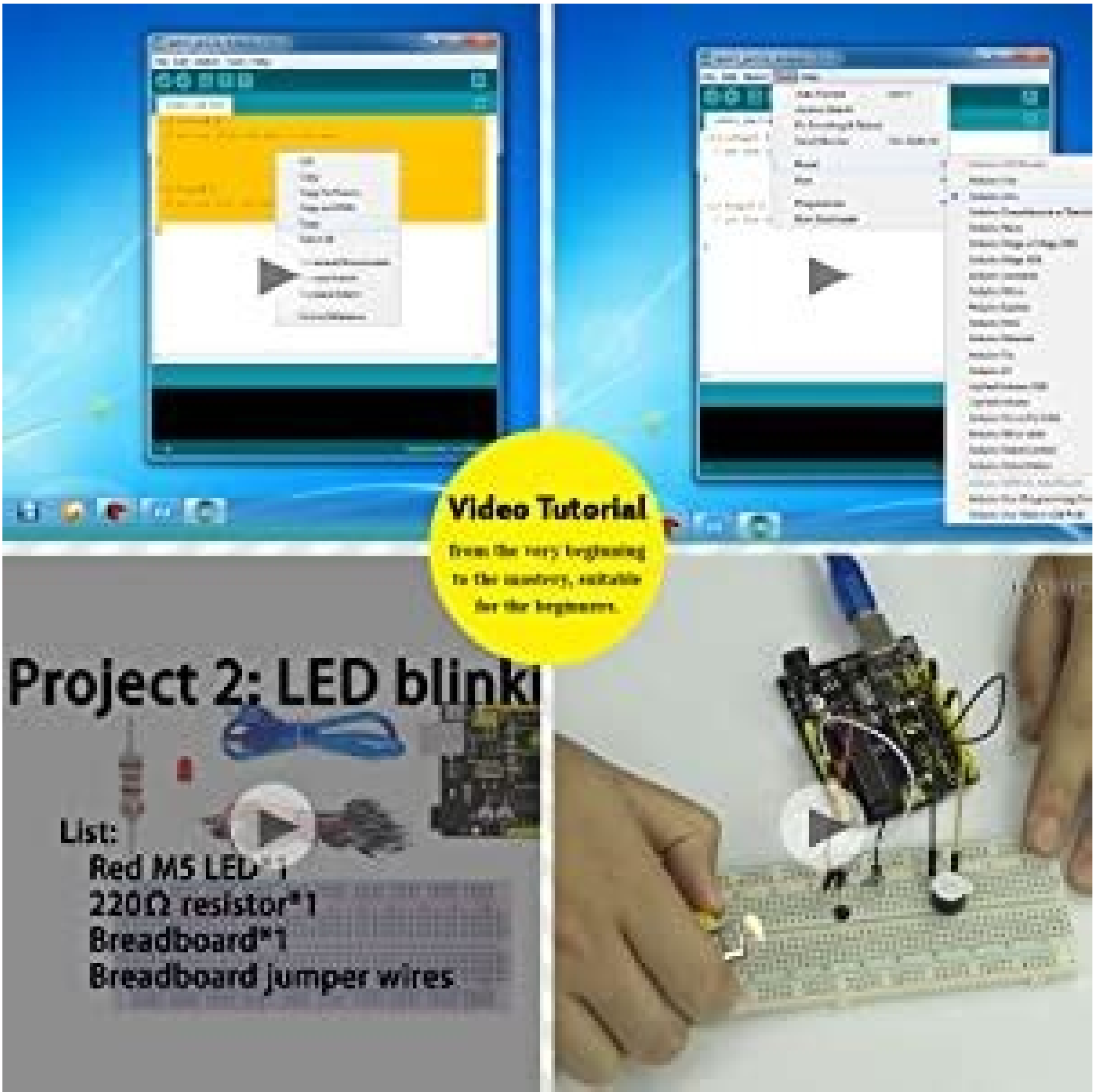
Arduino uno ultimate starter kit booklet pdf.